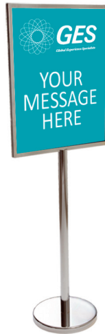
22" W X 28" H Chrome Sign Holder (sign extra)